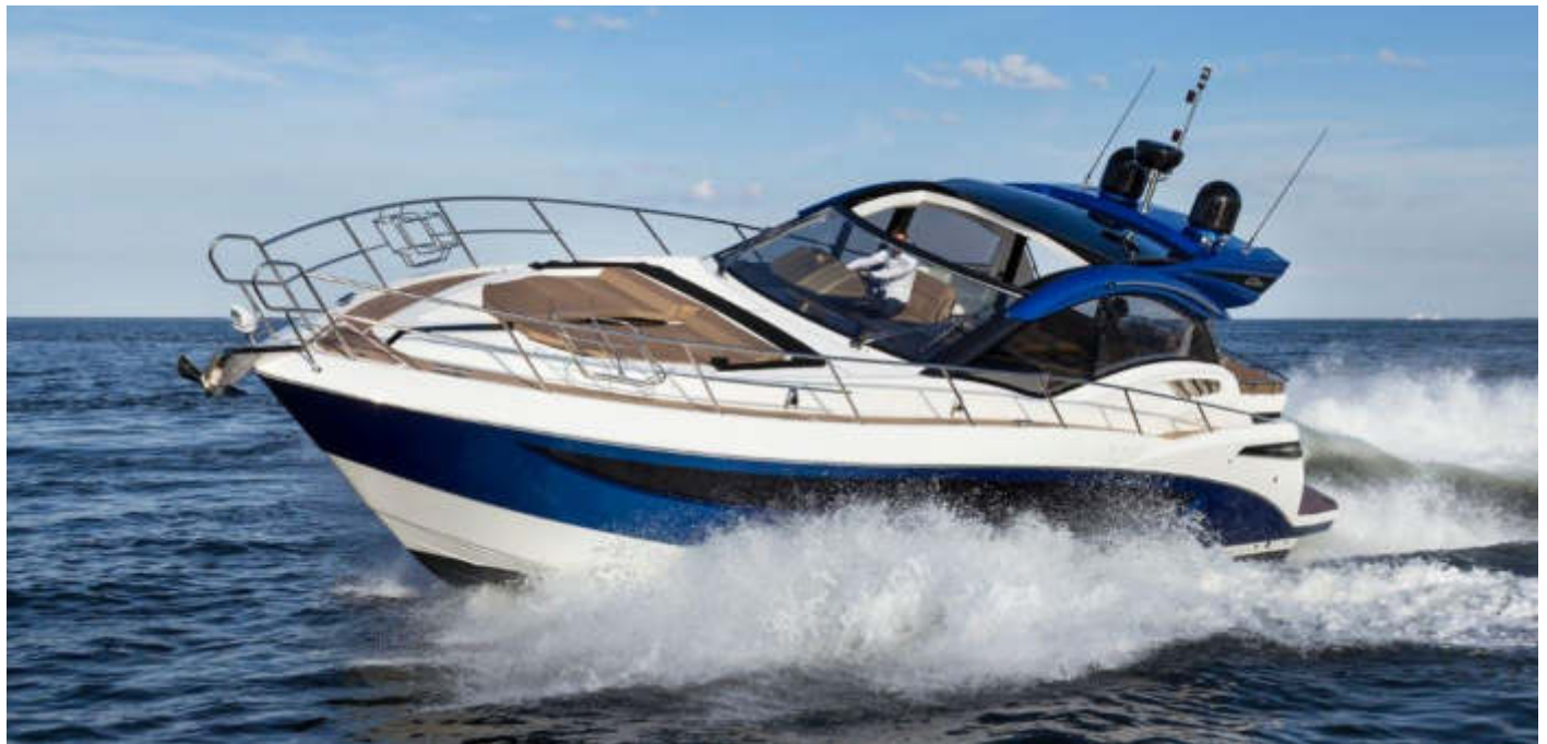
A sporty disposition of the 485 HTS —