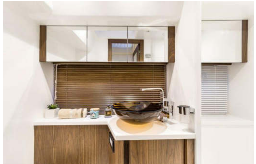
One of the two bathrooms below deck —