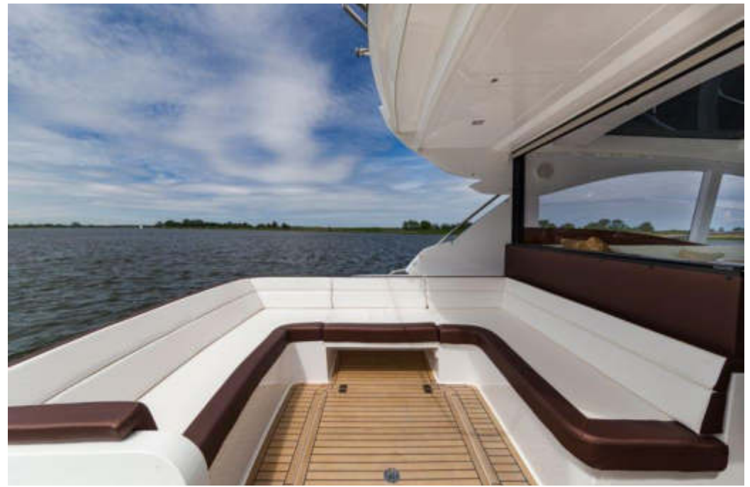
— Outside rest area