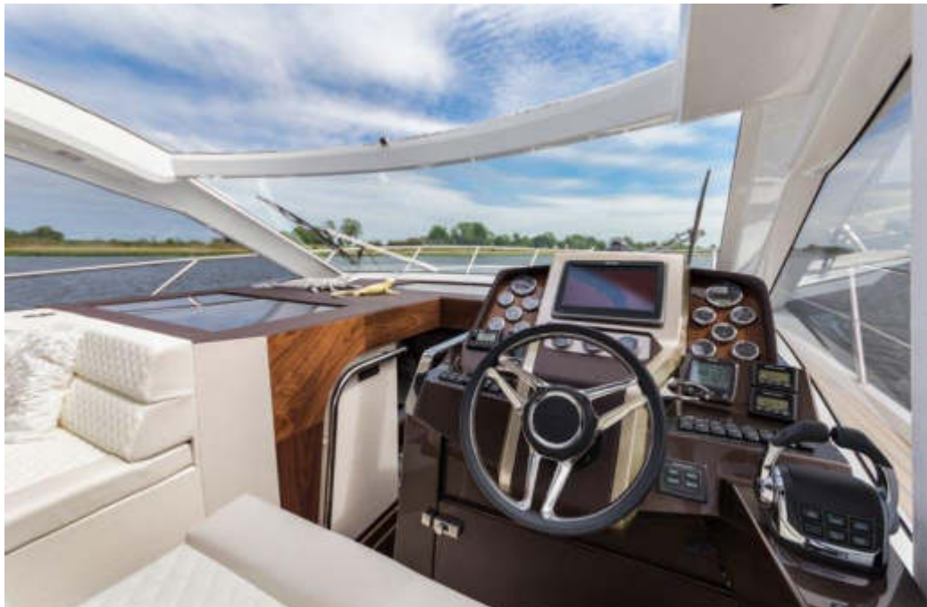
— Slide the sunroof and enjoy the breeze