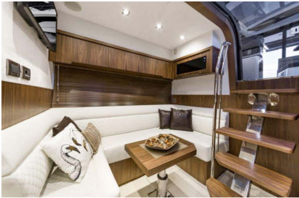
A dinette with a fold-out table —