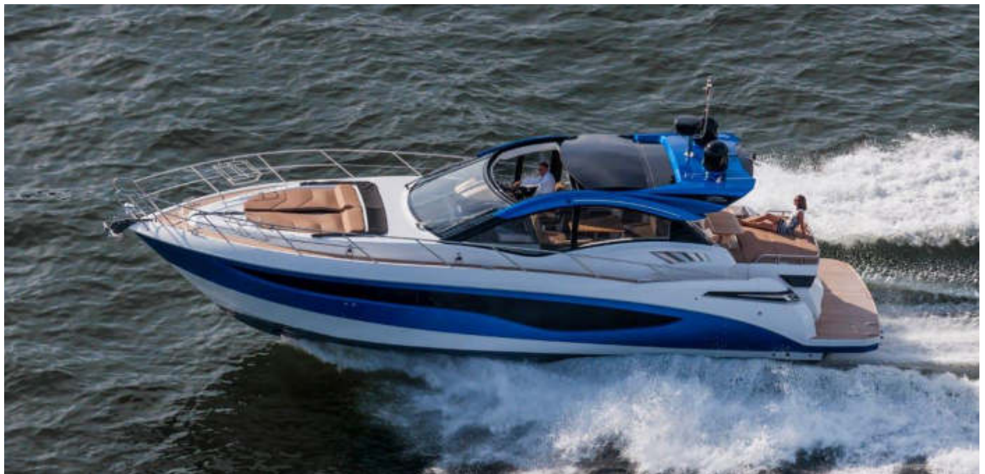
Perfect proportions compliment the sleek design —