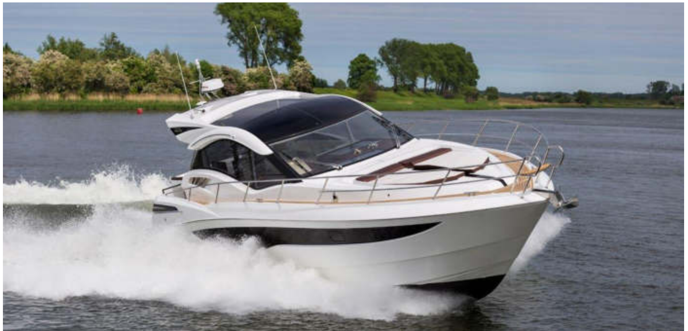
Tight handling and great performance —