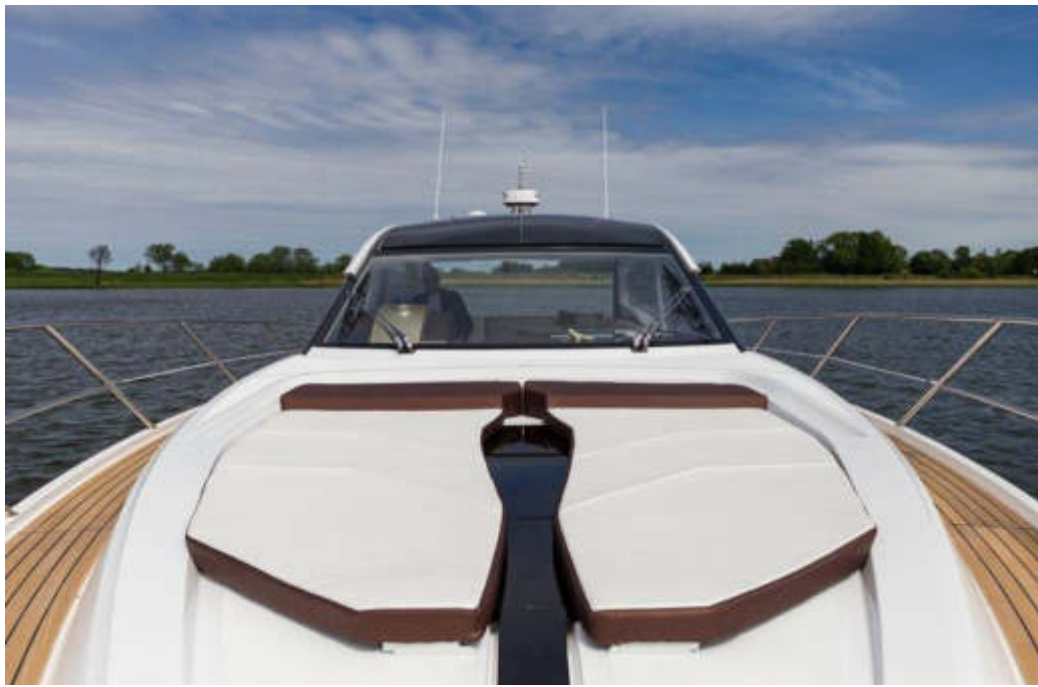
— Bow sundeck area