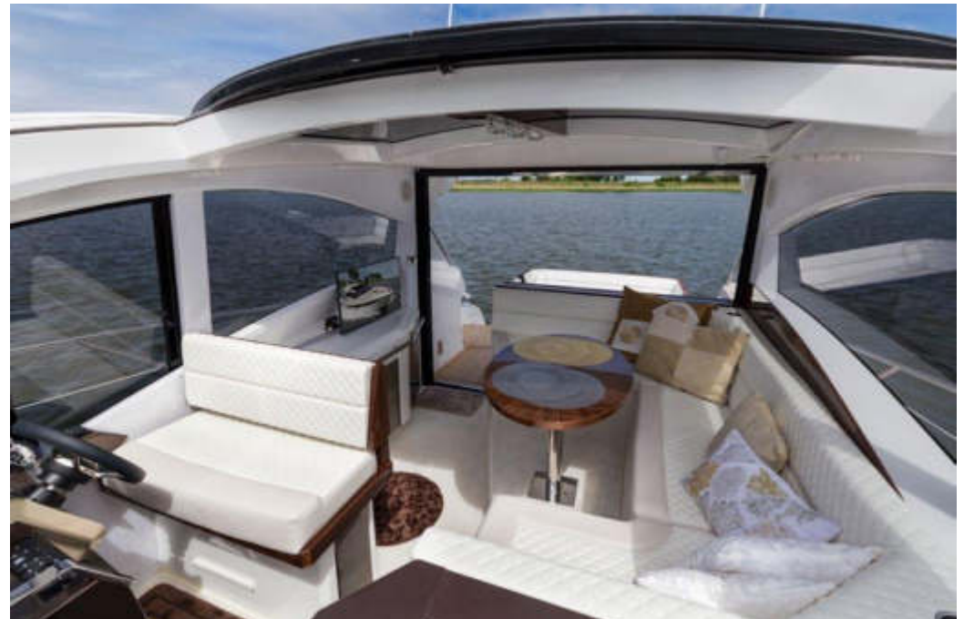
— Open the glass door and drop the window for an open cockpit experience