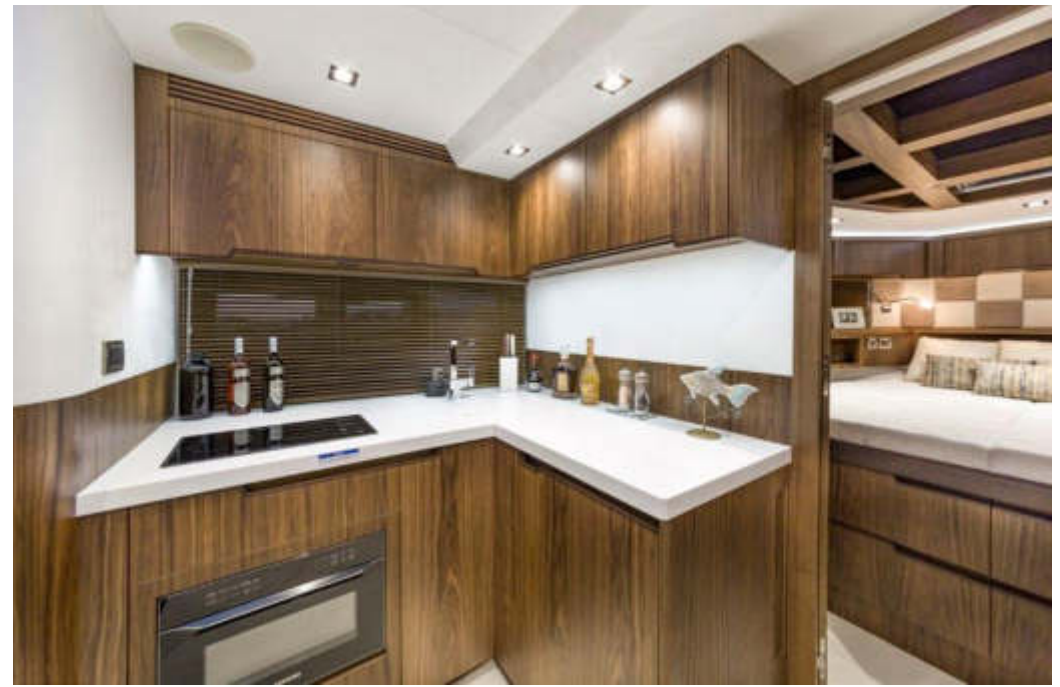
The compact galley will store all the necessities —