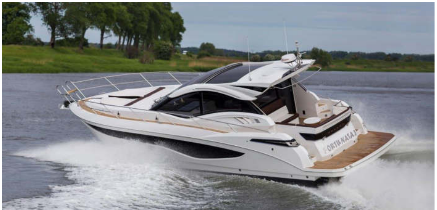
Make use of the available bath platform —