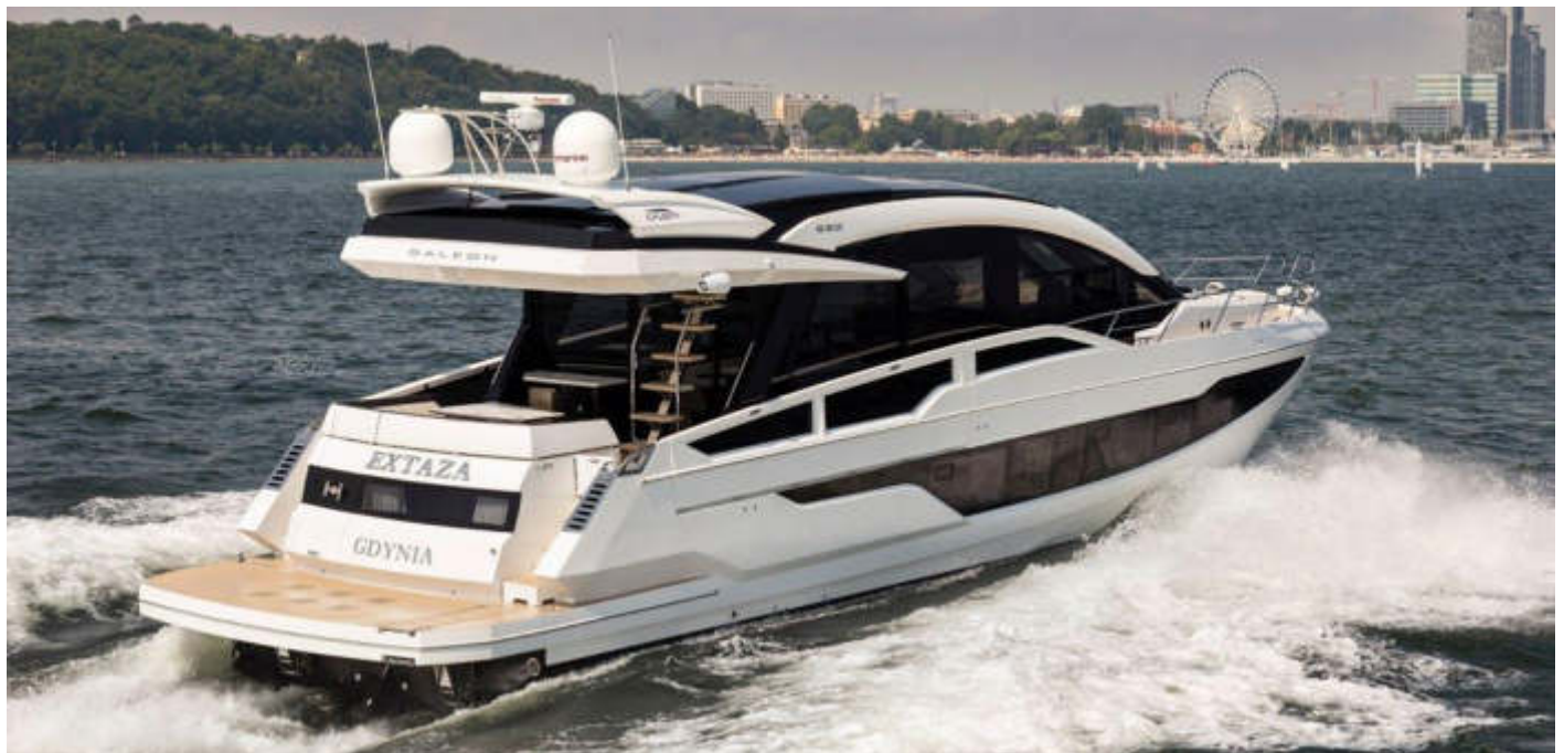
Simply close off the roof and the SKYDECK becomes a hardtop – brilliant! —