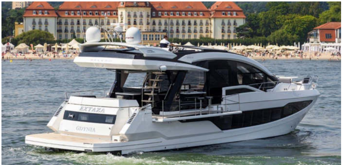
A hydraulic platform with access to the crew cabin