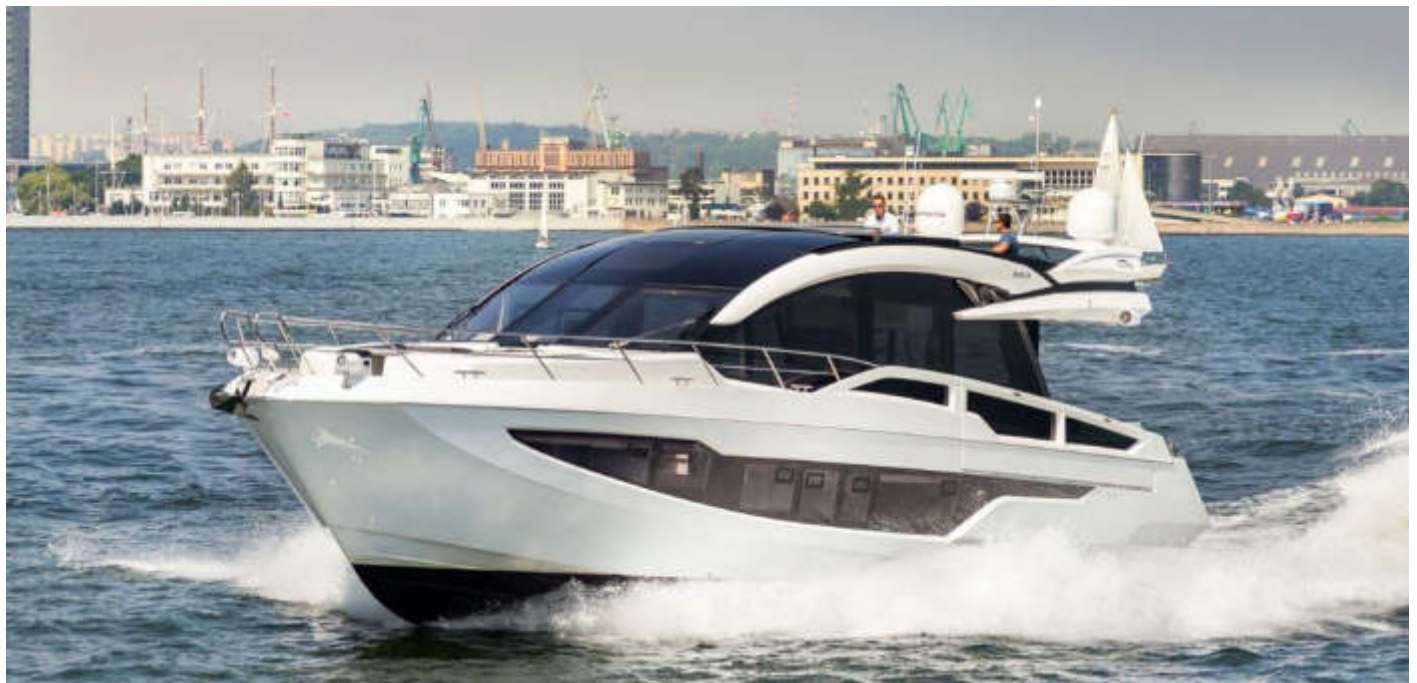
Supreme handling and performance —