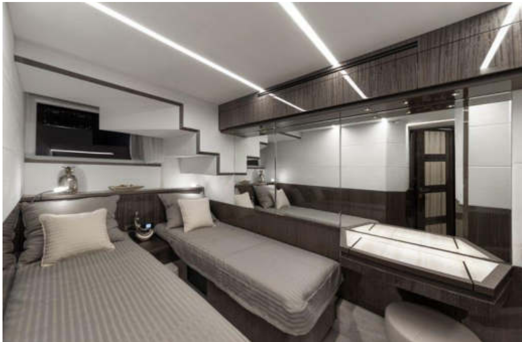
Twin beds in the guest cabin