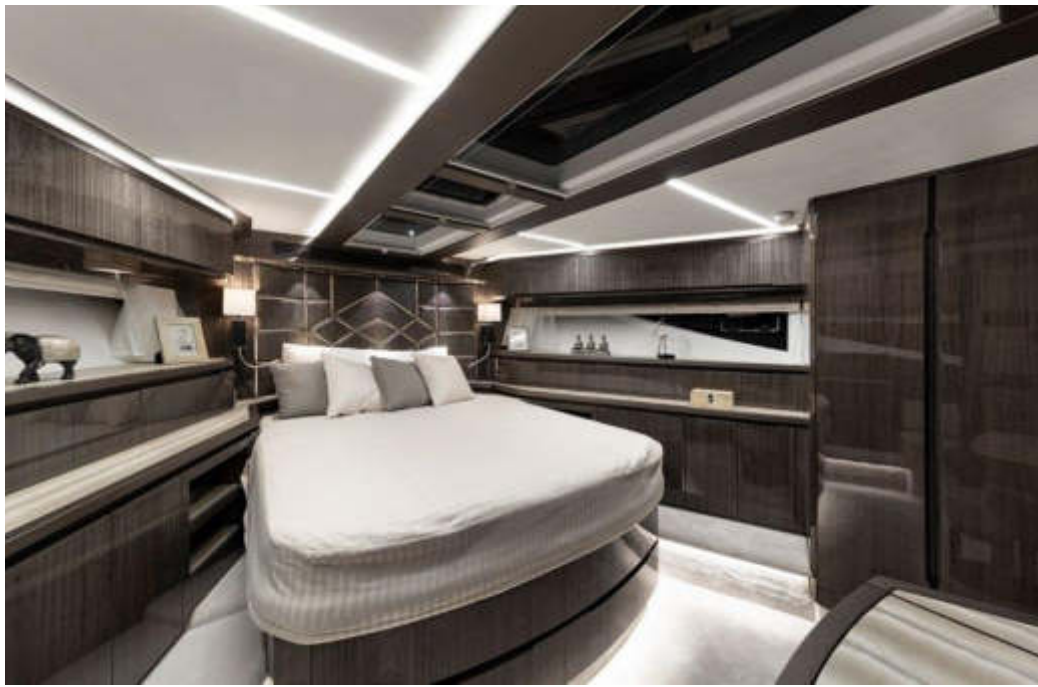
Forward VIP cabin with separate access and private bathroom