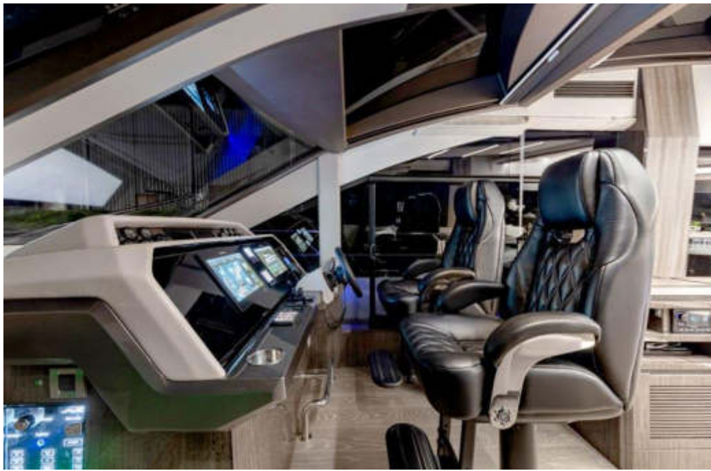
Two sport seats occupy the helm area —