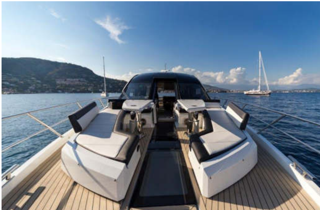
— Plenty of space in the cockpit for all activities on the bow