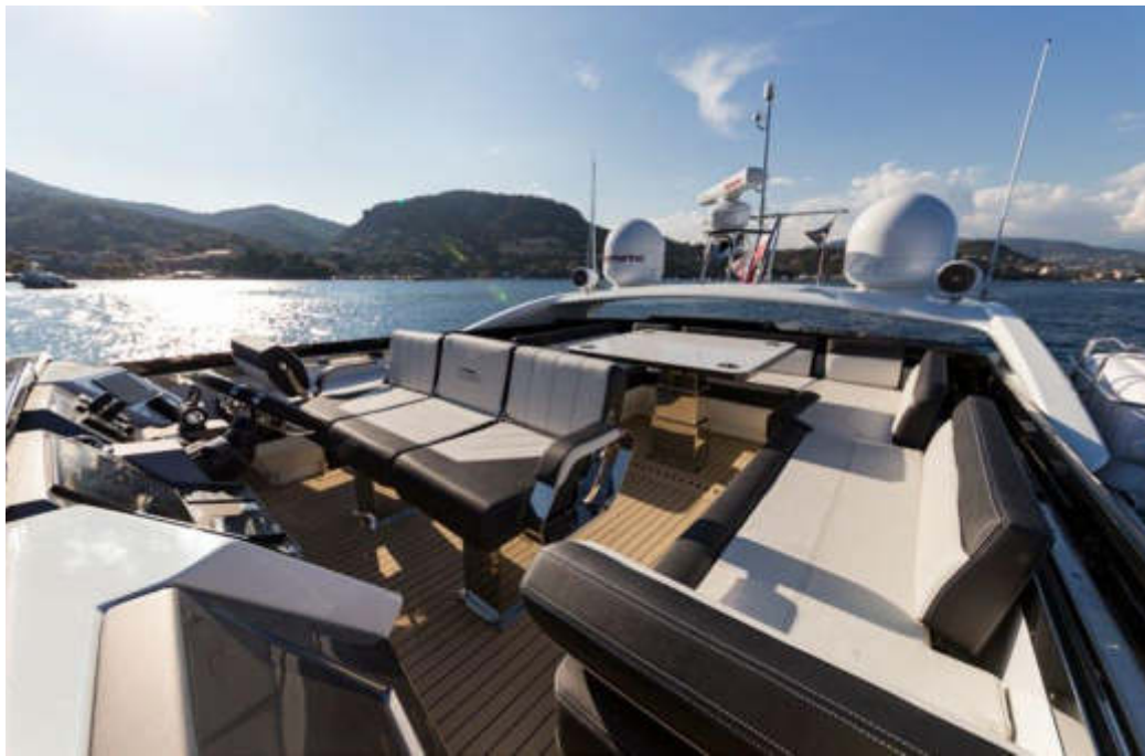
— Create magical moments on a huge upper deck area