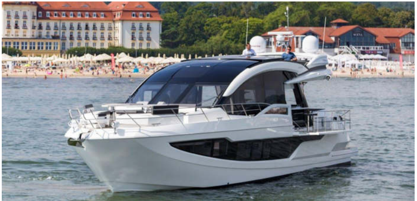
The middle panel of the windscreen retracts providing easy access to the bow