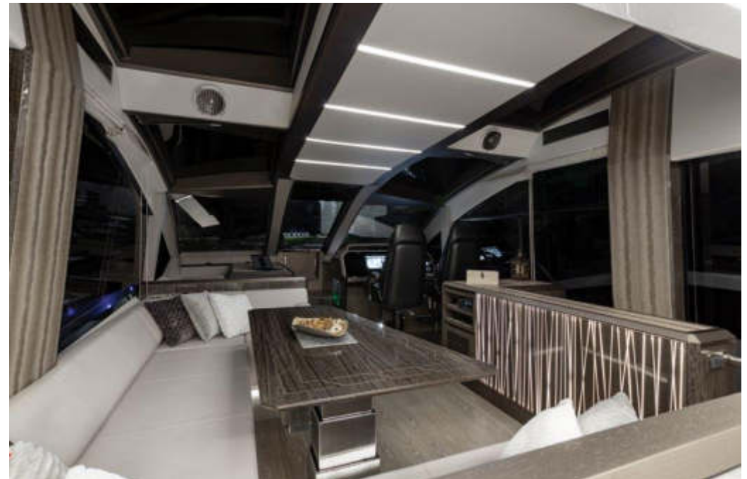
Notice the incredible amount of windows all around —