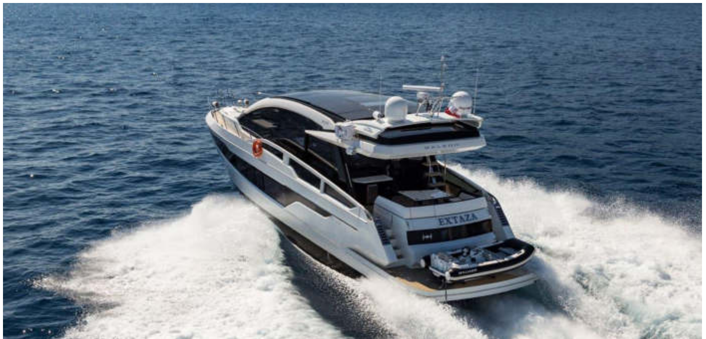
Beach Mode in this model is partly glazed —