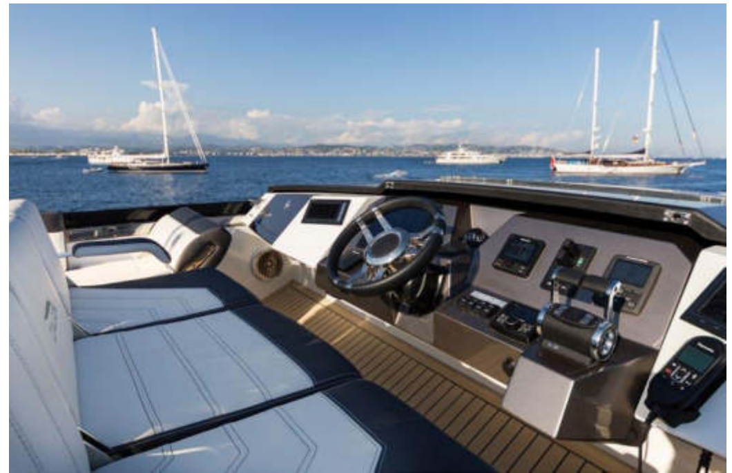
— The whole top deck can be quickly closed off by a carbon roof – genius!