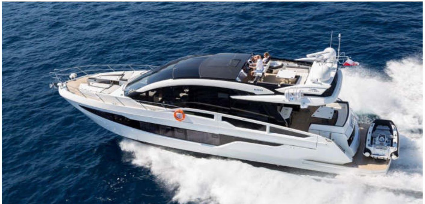
Find repose on fold-out sofas in the bow with an additional table —