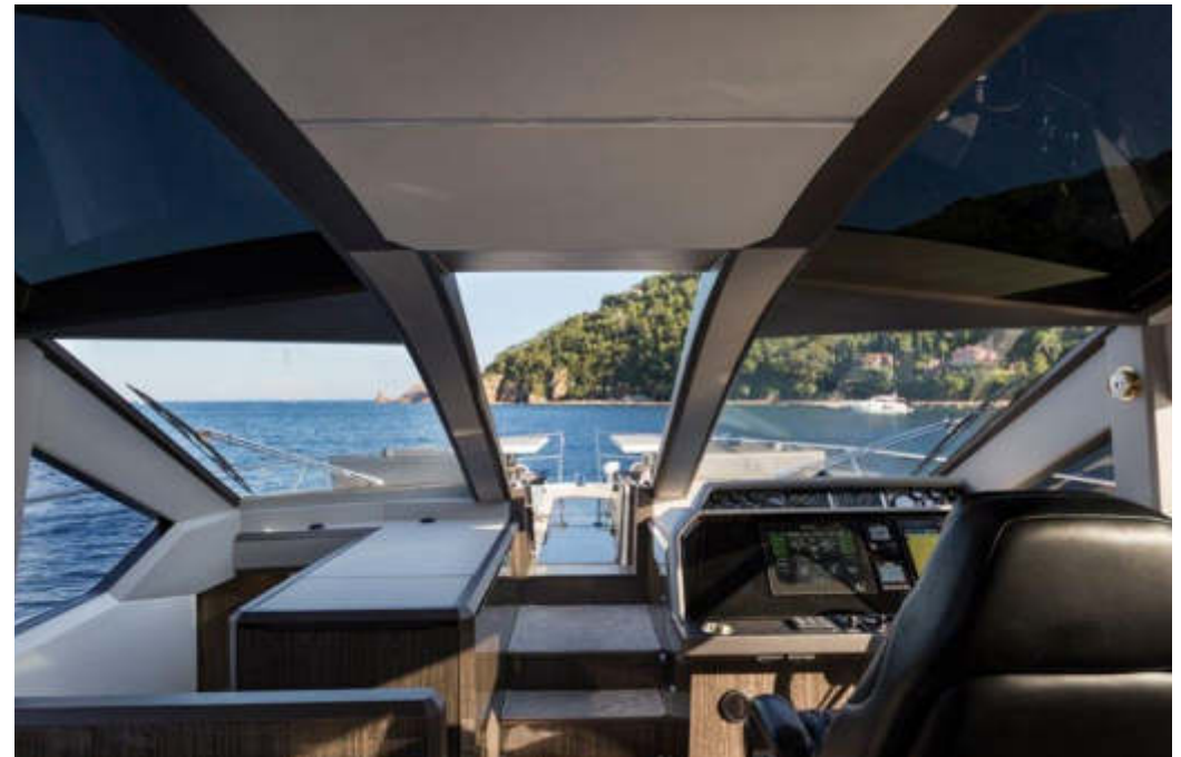
— Retractable windshield system which opens a direct passage from the saloon to the bow space