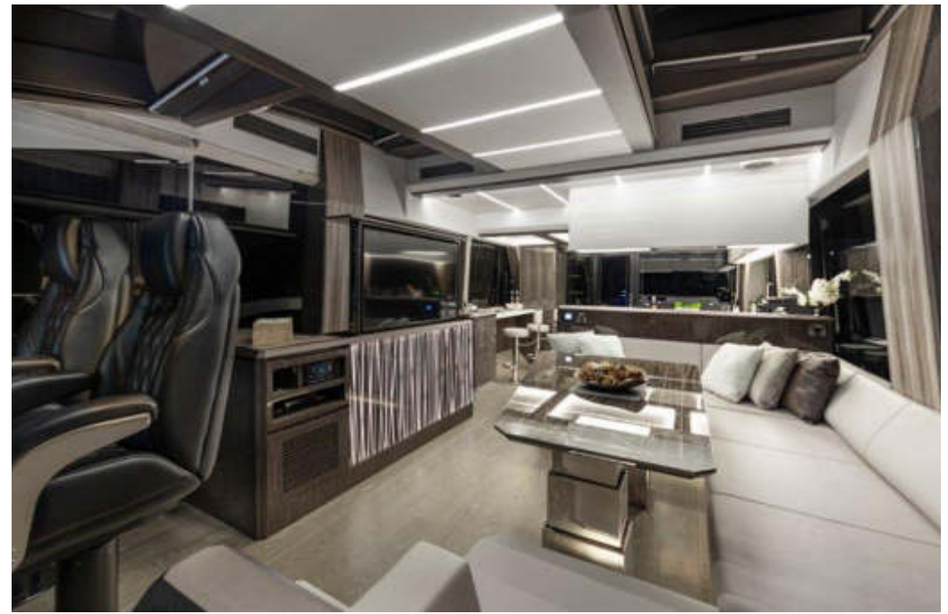
A large TV in front of the entertainment area —