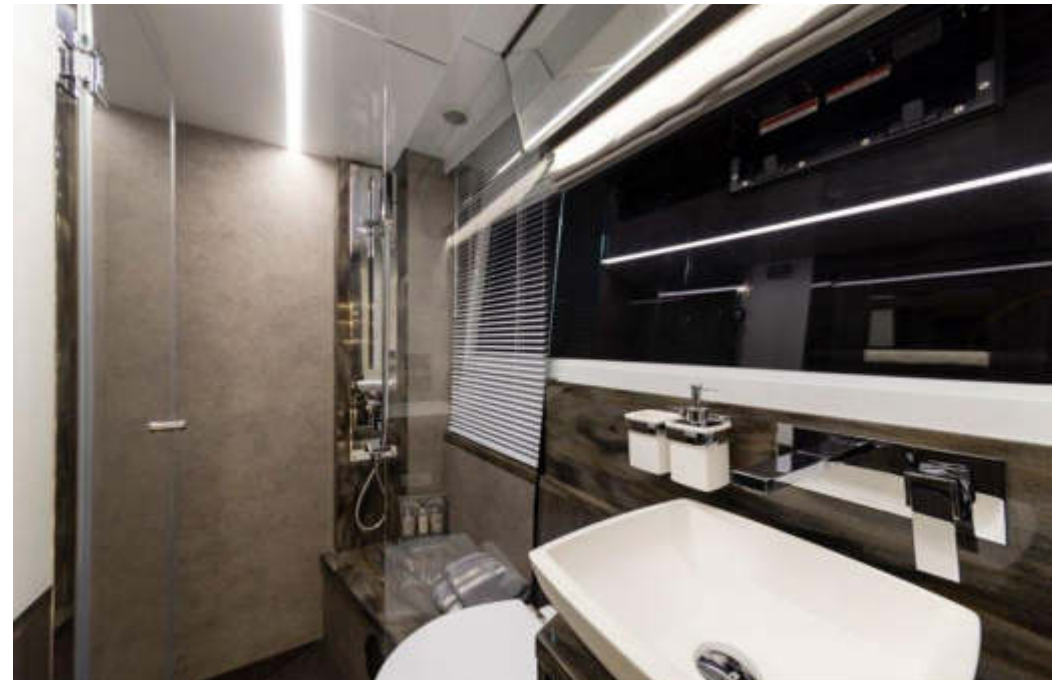
Large windows can be found in all cabins and bathrooms