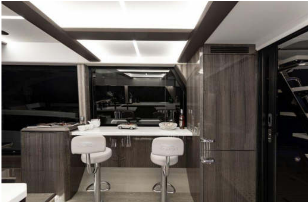
Slide the window and serve drinks to the outside area! —